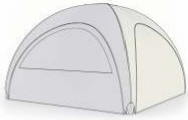
VENTO tent with a window.