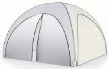
VENTO tent with wall with vertical zip.

VENTO tent has no printing limits! The shell is 100% printable and colorful materials from our STANDARD Plus Palette can be provided for the legs.